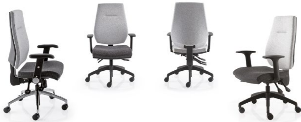
VG(4) AAG CSB

VEGA Modern task chair with tailored upholstery and stitch detail with a choice of mechanisms.