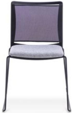
RIVA MESH (SP)