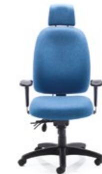
PPI(3) SS-HR AA