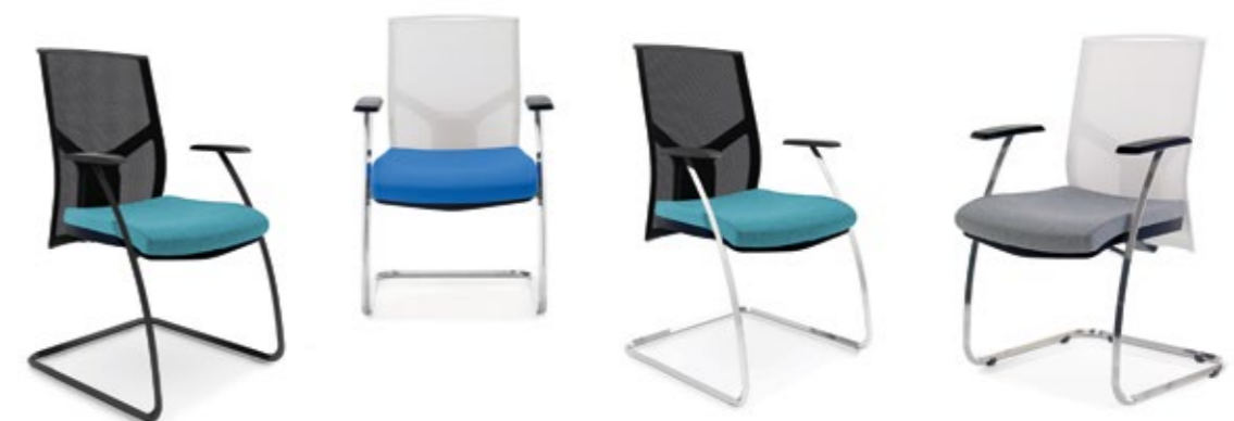
AeM BLACK BCA

AEON MESH Contemporary boardroom and meeting chairs in black or chrome frames.