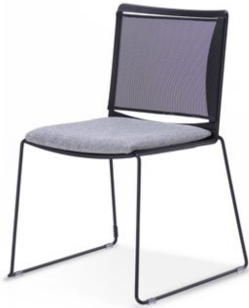
RIVA MESH (SP)