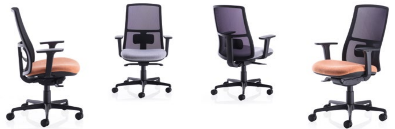
MOTION (10SS) AAS

MOTION Broad mesh back design with adjustable lumbar support, seat slide and self-tensioning mechanism.