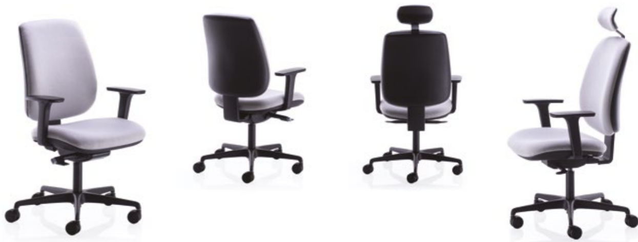
TEMPO (10SS) AAS

TEMPO Substantial task chair with synchronised body balance mechanism, seat-slide & ratchet back height adjustment.