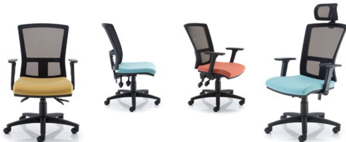
LINX(2) SS AAT

LINX A generously proportioned mesh chair with a choice of two mechanisms and optional headrest.