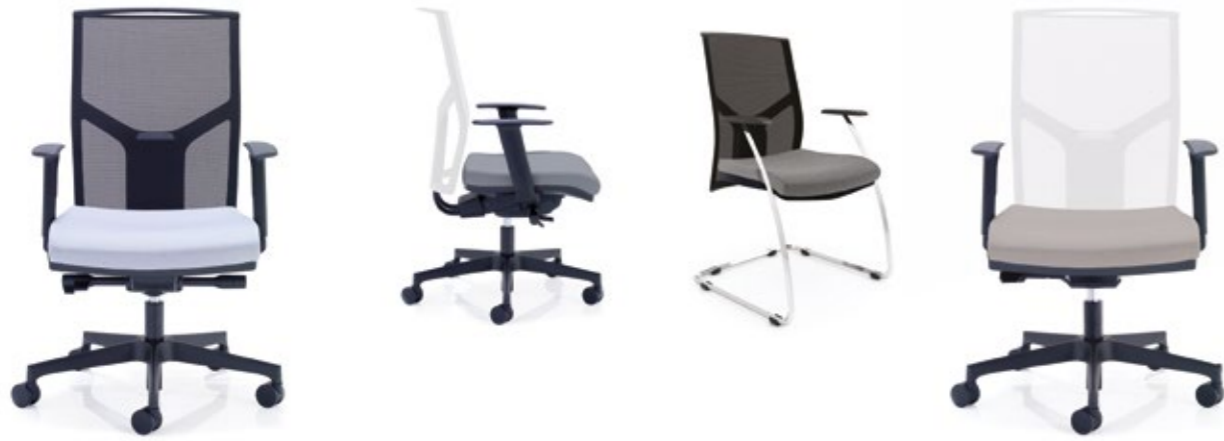
AeM BLACK(10SS) AAT

AEON MESH Awe-inspiring task and side chair offering, available in a contemporary black or white mesh finish.