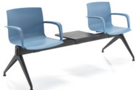
BEAM JL(2)PL + BST

ECLAT BEAM Multi-position beam units with fully upholstered seats.