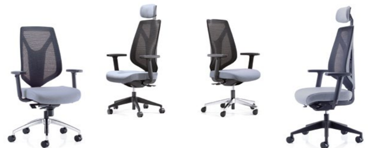
MTM2A (10SS) CSB

MENTOR MESH Sculptured mesh back chair with ratchet back height adjustment, seat slide and self-tensioning mechanism.