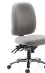
PPI(3) SS CBY