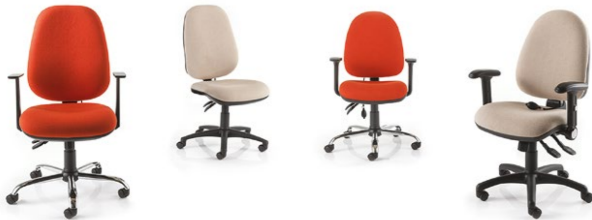
Pi23(3) AAT SCB

PRETORIAN Popular task chair with inflatable lumbar in standard size or with optional larger seat and backrest.