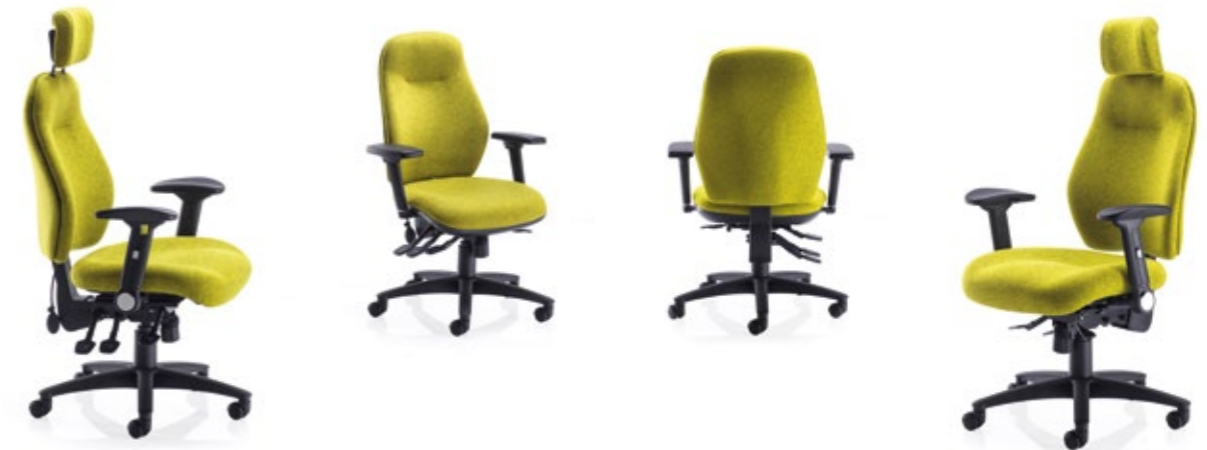
E4 (XL) HR AAGC ILS

E4 Posture chair with extra large sculptured back, multi-function mechanism, memory foam seat and integral seat slide.