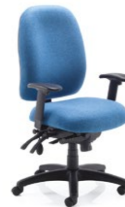
PPI(3) SS AA

POSTURE PLUS Memory foam seat, inflatable lumbar, seat slide and tilt with height adjustable backrest.