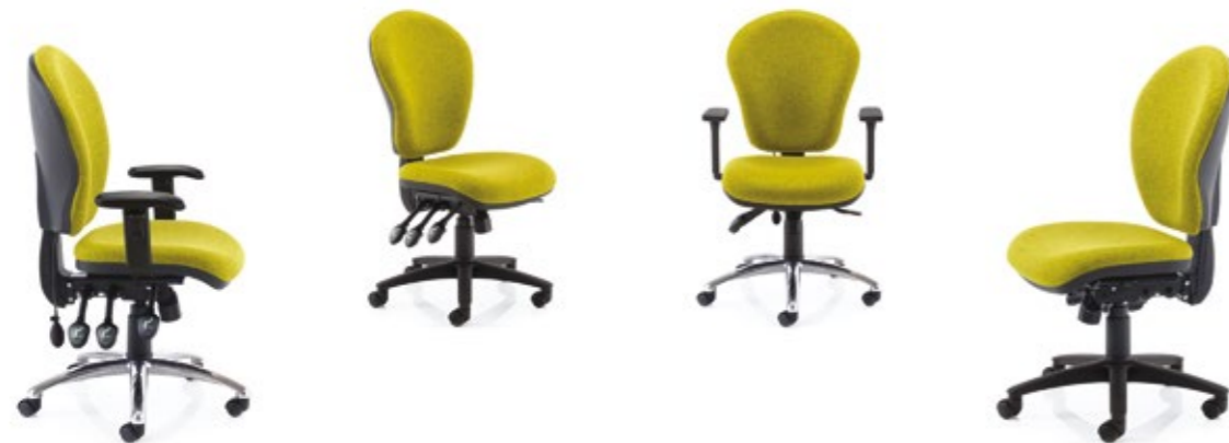
E1(S)AA ILS CBY

E1 Posture chair with standard backrest, multi-function mechanism, memory foam seat and integral seat slide.