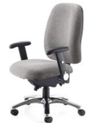
PPI(3) SS AAG CBY