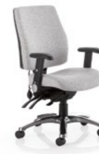
PM2 AAG CBY