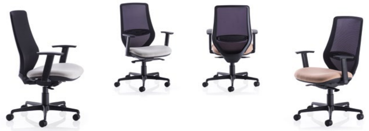
POSE (10SS) AAS

POSE Distinctive back design with adjustable lumbar support, seat slide and self-tensioning mechanism.